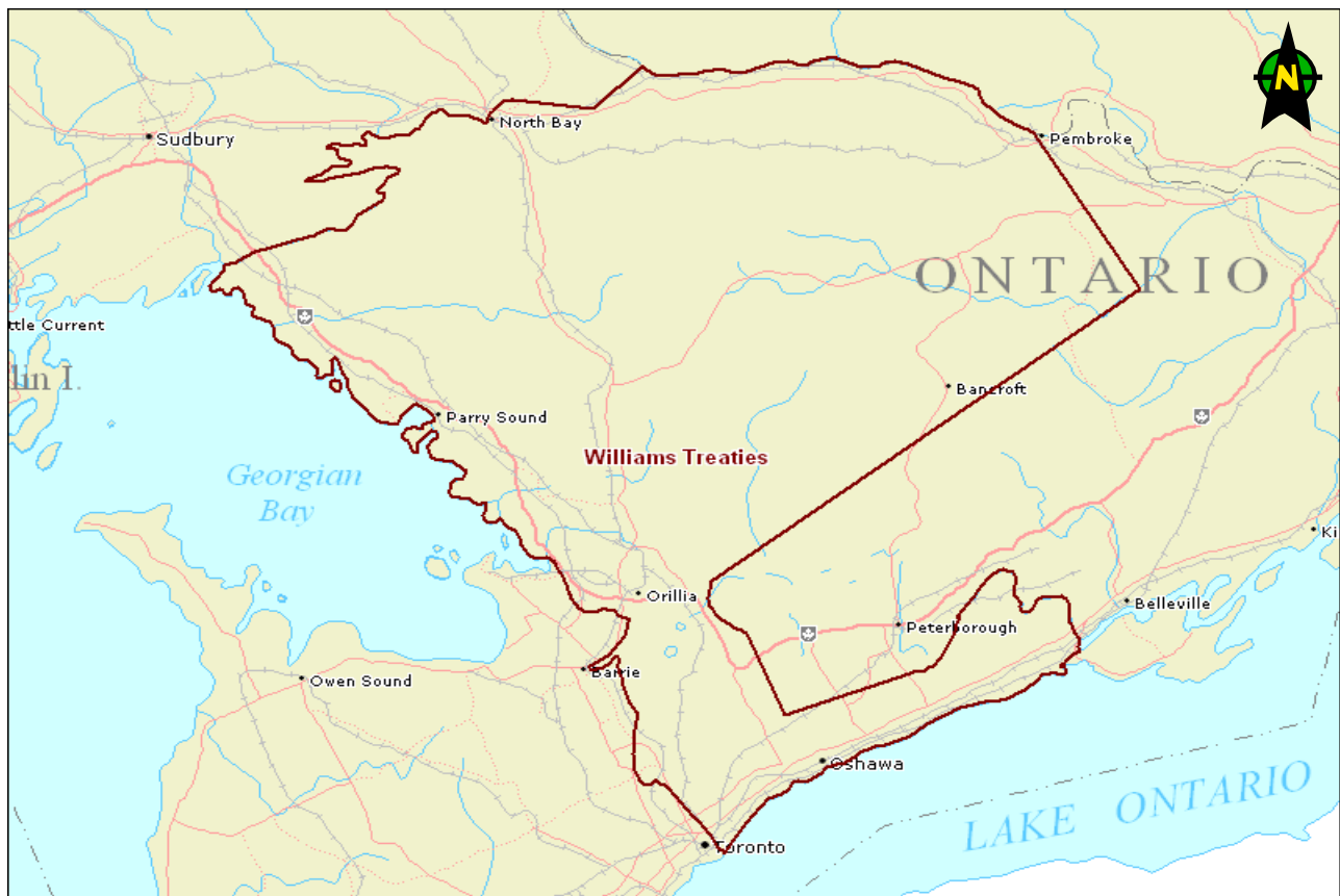
Figure 2 Williams Treaty Land Claim Area

Source: 2005, Treasury Board of Canada Secretariat, Directory of Federal Real Property